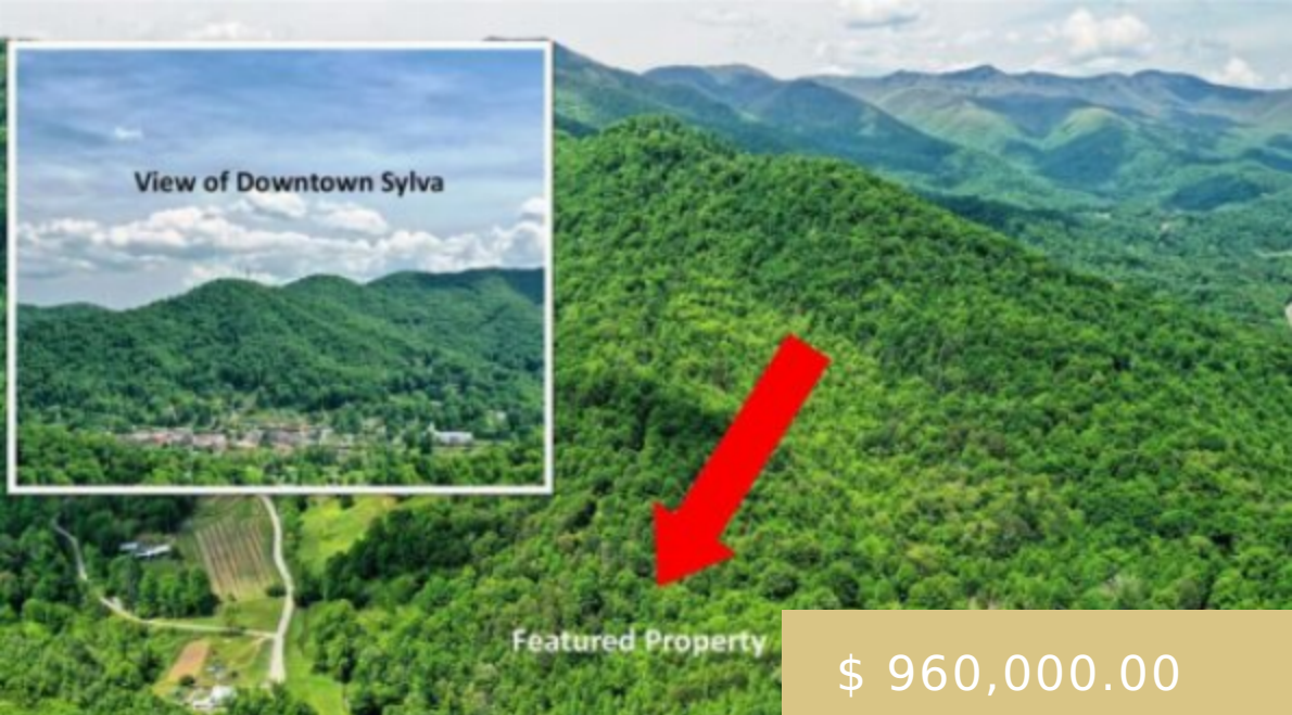
View of Downtown Sylva